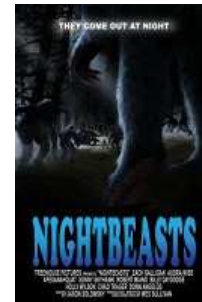
Official Movie Poster for the Upcoming Creature Feature Nightbeasts