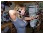
Girl Shoots Dad With Bow And Arrow