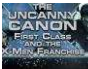
X-Men: First Class, Canon Or Un-Canon?