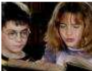
Harry Potter 7: Behind the Scenes