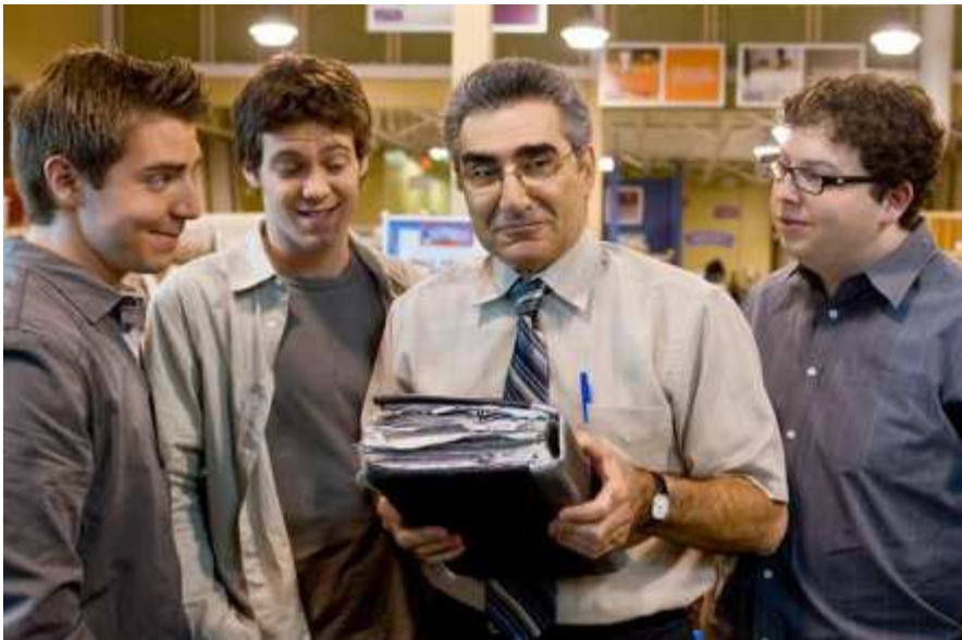
American Pie 7 - Set Visit