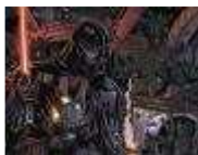
Vader vs. Aliens