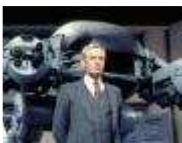
10 Bad A$$ Villains Who Really Weren't