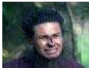
Jersey Shore Re-Enacts Twilight