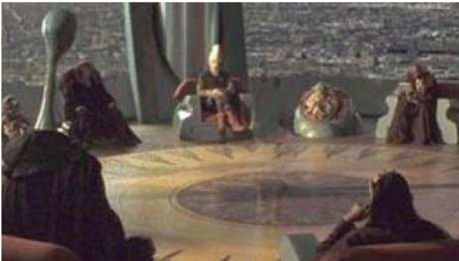
Ask A Jedi