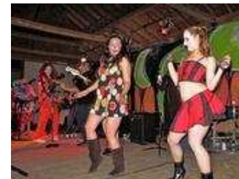
10:00 p.m. at Clown Town