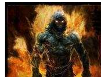
Really Bad Buzz-Rock Album Covers