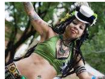
Saturday Afternoon at iFest