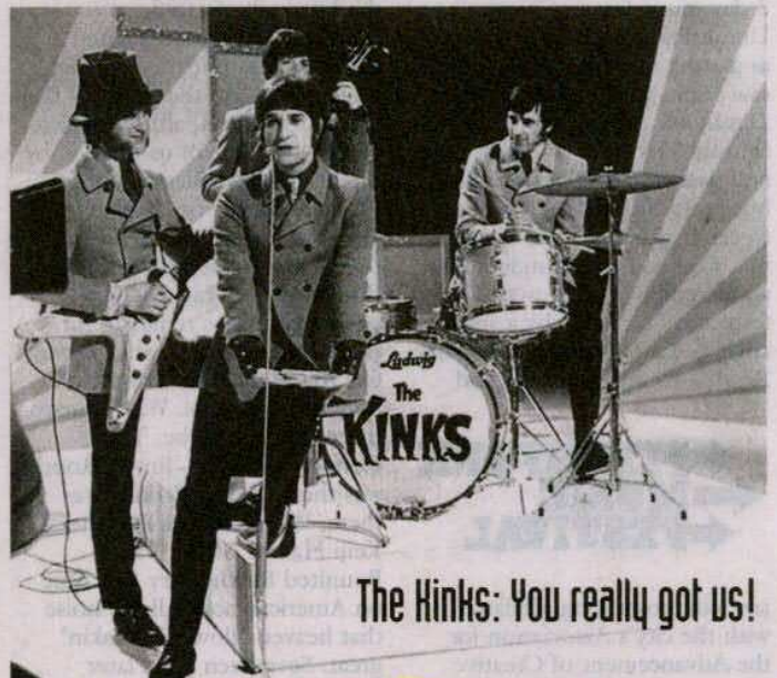
The Kinks: You really got us!

Axl Rose got all pissy-pantsed and threatened to walk offstage after fans assailed him with water bottles and other flying projectiles during Guns 'N Roses' recent performances in Sao Paulo, Brazil and Lima, Peru. Perhaps he should learn to take a hint, especially when it hits him square in the