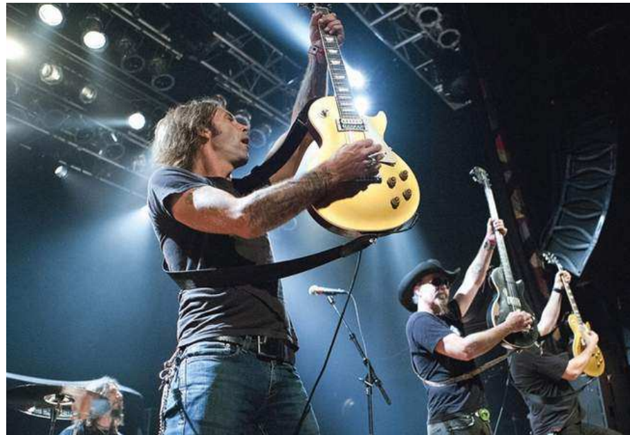
The Supersuckers, along with The Toadies and Battleme will perform April 19 at The Grog Shop in Cleveland.