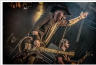
Vocalist and bassist Eddie Spaghetti and the Supersuckers perform Thursday at The Hop. (Full-size photo)

Tags: Eddie Spaghetti spokane7 Supersuckers