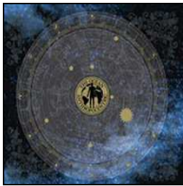
• Enslaved - Axioma Ethica Odini

At times this album may get too random, but it sure will never disappoint. The good part about the randomness is each track has a point. There's no aimless lyrics, no musical sections that rub the ear hole the wrong way. Everything is just made with the best intentions of being more than just the typical metal that is heard these days. Instead of being confined to one area, (Sic)monic explore many different ones, picking and choosing to create a selection of music that is just as witty as it is aggressive. There are so many influences here, from Between the Buried and Me to Job for a Cowboy to Tool to even Willie Nelson. It's certainly worth checking out for those who want something complex and exciting the whole way through without feeling like the band is crashing into any pitfalls with their style.