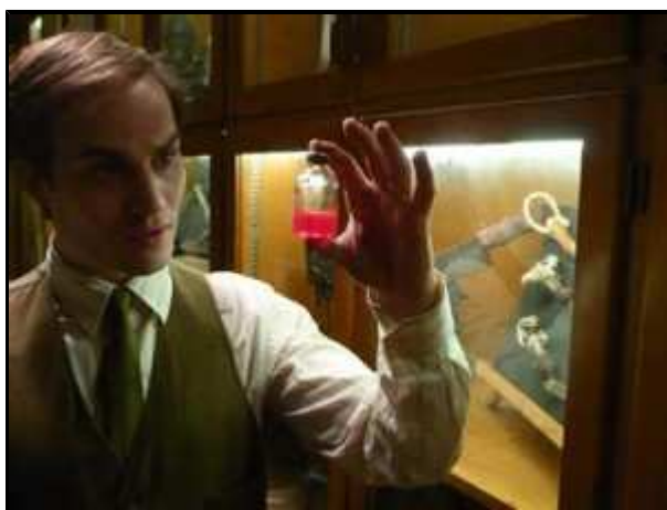
The Manager and the alien life form.

Though the cannibals sprint, growl, spew black ooze and bite into warm flesh in the same manner as those in 28 Days Later , they do differ slightly in their movements and not for the good of the film either. I like to call them " parkour cannibals ". Are you familiar with the term " parkour "? It is a recent, nearly suicidal, new craze that involves athletic agility and a set of balls as big as the moon. The men and women who do parkour scale and jump buildings without any aid of straps, ropes, pulleys or each other. These cannibals were doing just that - flipping off humvees, doing vaults over rails, etc. There was a certain zaniness about it that should have solely lied with the Hispanic Moe, Larry and Curly.