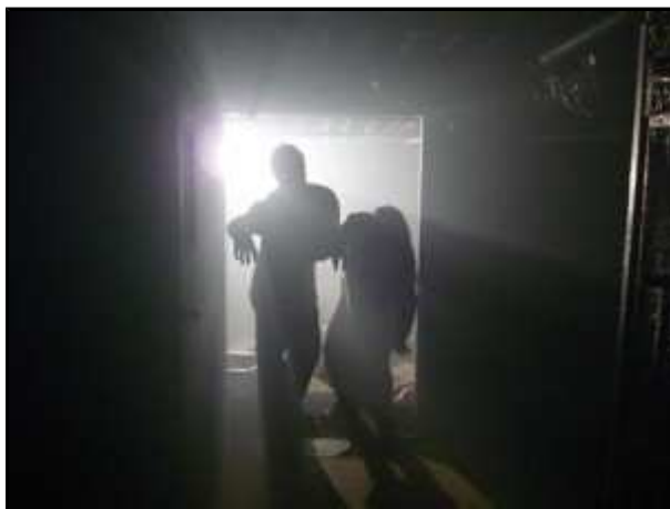
No escape from the infected!

could come to that conclusion. As far as Re-Animator goes, the homage there is the presentation of the alien life form. Having a brilliant yellow or orange color (I'm a bit color blind, sorry!), it is a liquid, stored in a medicine bottle and used to re-animate dead tissue - sound familiar? Even Darren Hall has similar Herbert West features about him - scrawny, glasses, a social misfit - but he does bring new qualities to the table like his charm and his ability to care for others - West has neither. Lastly, we come to 28 Days Later . The infected tenants turn into the same type of monsters as you would see in the Danny Boyle film and this is the strongest, and most evident, indication of homage displayed.