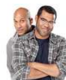
Photos: Faces to watch in TV, film and media