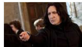
Alan Rickman looks back on decade of dark magic

Terms of Service | Privacy Policy | Los Angeles Times, 202 West 1st Street, Los Angeles, California, 90012 | Copyright 2012