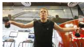
New Year's resolutions work best in small steps