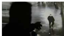
'Person of interest' detained in L.A. arson fires