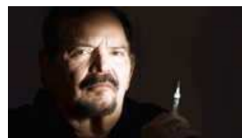
Blemishes mar celebrity dermatologist's reputation