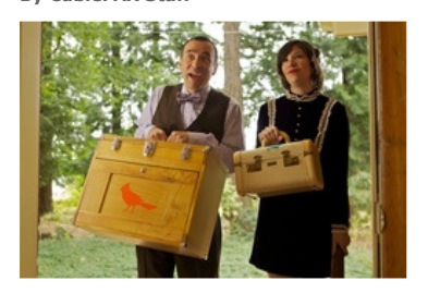
Best Actor/Actress/Host - Comedy