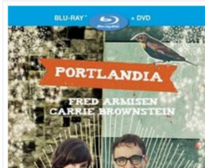
Portlandia Season One Credits: IFC