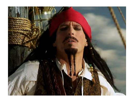
'SNL': Best/worst moments of 2011