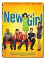
New Girl Season 1