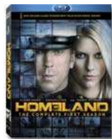
Homeland The Complete 1st Season

Portlandia - Official Press Release for 'Season 2' on DVD, Blu-ray (and Combo S1/S2 DVD) All will be available starting September 25th Posted by David Lambert 9/19/2012