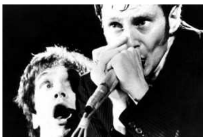
Wilko Johnson and Lee Brilleaux

The director's career began in music videos, the single tracking shot of his video for Janet Jackson's "When I think of You" typical of his early, elaborate success. But his career turned south with the ambitious flop Absolute Beginners (1986)