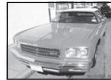
1975 Chevrolet Classic convertible

While driving along Hancock Street in Quincy recently, I stopped off at O.B.'s Diner for a bowl of oatmeal and spotted a beauty of an automobile parked next to the diner. It was a red Chevy Classic convertible from 1975 in mint condition. Eight bolt cylinders and plenty of room for a bus load of passengers.