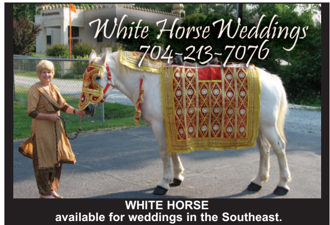
WHITE HORSE available for weddings in the Southeast.