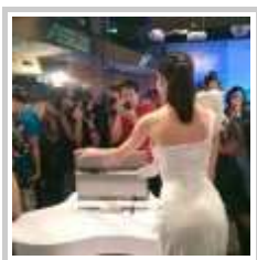
When Asus becomes Assus