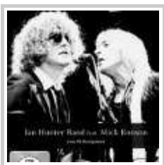
Rockpalast DVDs Ian Hunter John Lydon Michael Schenker