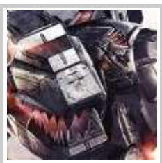
Xbox Live Update for week of through July 29 through August 4, 2012