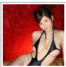
Porn is the key to 3D HDTV expansion | GamerTell