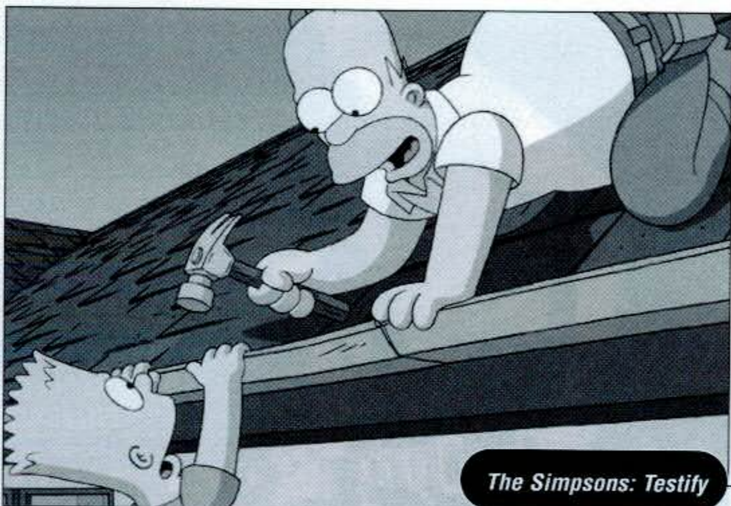
The Simpsons: Testify