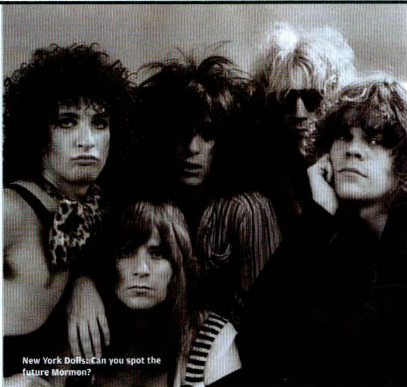
New York Dolls: Can you spot the future Mormon?