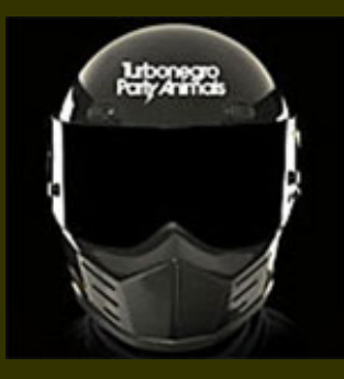
Turbonegro Party Animals » read our review