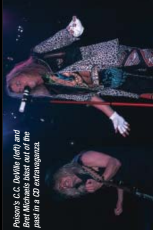
Poison's C.C. DeVille (left) and Bret Michaels blast out of the past in a CD extravaganza.