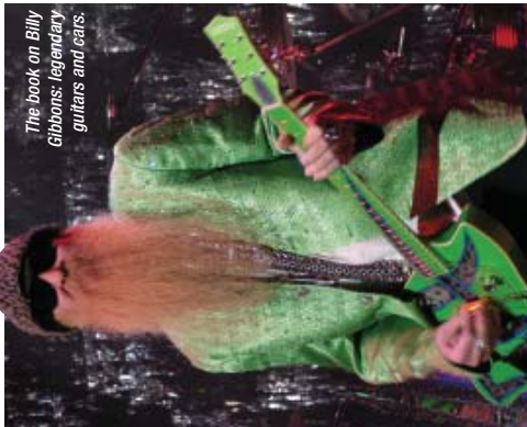
The look on Billy Gibbons: legendary guitars and cars.