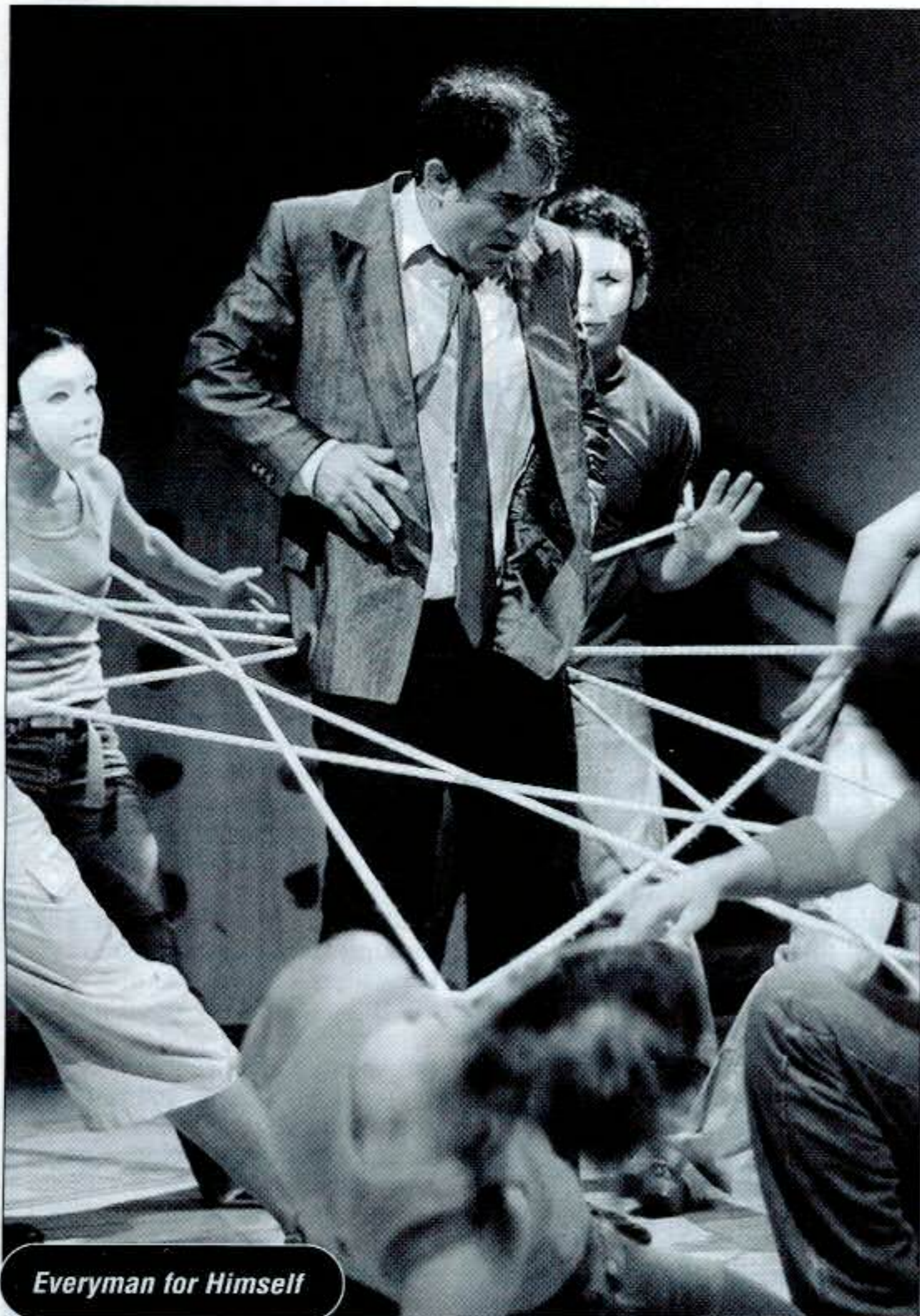
Everyman for Himself

Everyman for Himself , described as Cirque du Soleil meets Stomp , is a combination dance, acrobatics, and martial arts with theater. It tells the tale of a young man on a journey of self-discovery in a dog-eat-dog world.