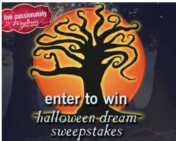
www.Virginia.org Feedback - Ads by Google