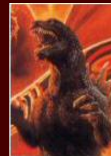
5. GODZILLA, MOTHRA AND KING GHIDORAH