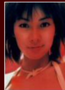
9. NINE SOULS