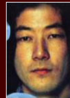
4. BRIGHT FUTURE