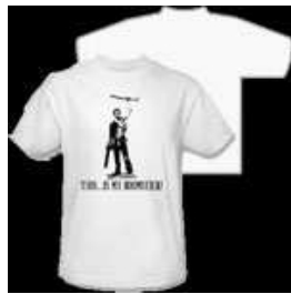
Army of Darkness Boomstick White Shirt