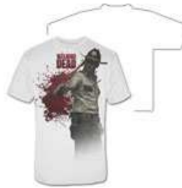
The Walking Dead Dot Splatter Shirt