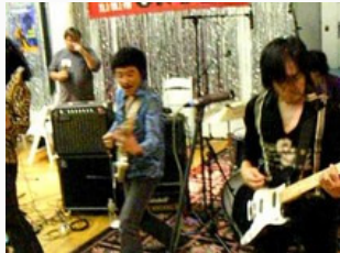
Video: Live From Tokyo