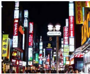
Streets filled with music...