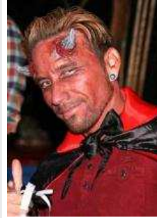
Halloween @ Charlie Las Vegas :: November 2, 2013