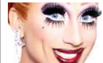
Hurricane Season: Bianca Del Rio Takes on Employment Discrimination