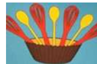
A British Comfort Food Invasion