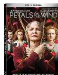
"Petals On The