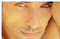
7 Tips for Protecting Your Skin While You Sleep