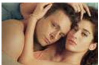
Lizzy Caplan and Michael Sheen on 'Masters of Sex'