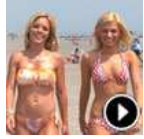
Down the Shore: Lucy-goosey in Margate