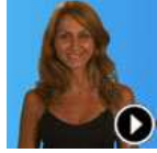
PhillyGossip: Ex-Fox 29 anchor heads to 'burbs