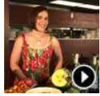
Philly Uncorked: Wines for Vegetarian Cuisine