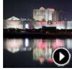
Mob Scene: The Big Hustle