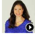
SnapGlow.TV: Mom-Preneur MAVENS