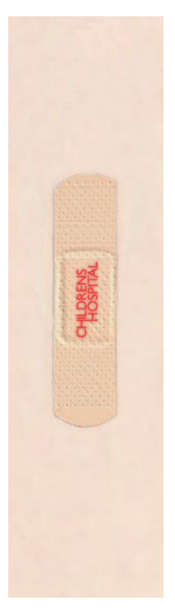
Thursday, July 22