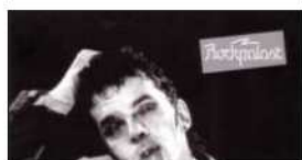
Ian Dury & The Blockheads Live at Rockpalast 1978 M.I.G - Rockpalast Archiv Rating: 2 stars

That said, it will go out - if proof were needed - that the best we certainly comes in only by the exhibition, in which Cale, even after a brilliant start, then ascends to considerable heights of interpretation, particularly in sections piano (two as those on guitar, strictly acoustic) and in more detail in "Buffalo Ballet," "Taking It All Away," "Chinese Envoy," "Thoughtless Kind," "Only Time Will Tell," and in the above (and all included in the segment final, including a) "Hearthbreaker Hotel," "Close Watch" and "" Streets of Laredo " .