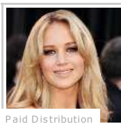
Jennifer Lawrence's X-Men Hair Color Trauma