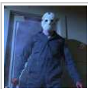
Alligator (DVD) (this site)