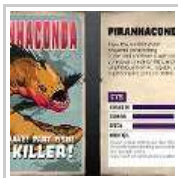
Piranhaconda Revealed - At Least Its Head (this site)