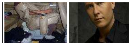
11 Photos Of Smuggling Attempts Gone Wrong

Discuss Alien 2 on Earth in the comments section below!