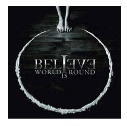
2010 Metal Mind Productions/MVD

http://www.metalmind.com.pl/index.php?jezyk=en / http://mvdb2b.com/