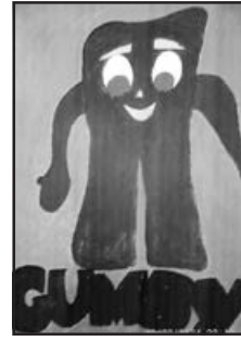
Gumby getting framed over someone's office desk. He told the cops; he had no idea where Pokey was.