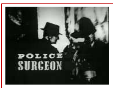
Image for The Avengers - Series 2 And Surviving Episodes From Series 1 (JPEG)

MyReviewer.com © 2007-2010 Reviewer Ltd. Various images and content © of their respective copyright holders, All Rights Reserved. All other images and all content © 1999-2008 Reviewer Ltd., All Rights Reserved. MyReviewer and its logo is a trademark of Reviewer Ltd.