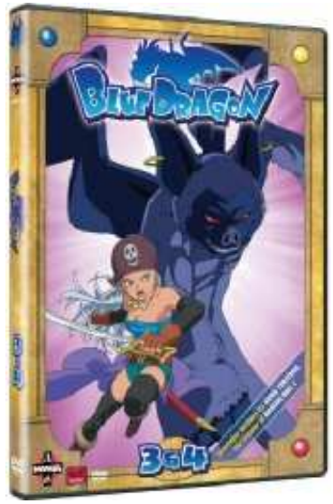
Blue Dragon - Discs 3 & 4 (JPEG)