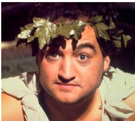
John Belushi as Bluto Blutarisky in "Animal House" National Lampoon's Animal House