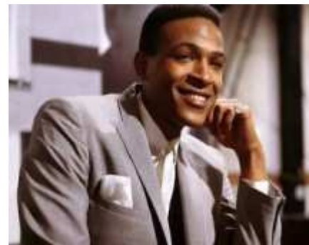
Marvin Gaye, Motown Superstar

When Marvin Gaye was five years old he began singing gospel and people marveled at his beautiful voice. On his way to Motown, he added the "e" to his last name. Despite his success, his father (who was living off Gaye's royalties) never approved of his career.