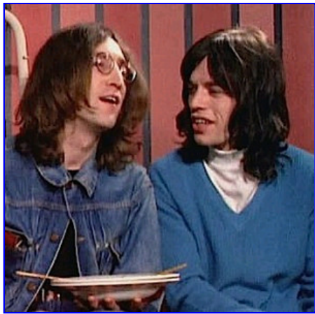
John Lennon and Mick Jagger back in the day

Now that Generation Boomer is shuffling slowly but surely towards the twilight of its purchasing power, spending far more time on the sofa than in the clubs or under the headphones, the DVD is becoming the preferred delivery system for the sounds – and, you bet, sights – of yesteryear. Of course with the Top Forty having long since gone TiVo, an audio-only package today seems as antiquated as, well, a record album ... remember those ? Even supposed sure-bets like those recent Beatles remasters, not to mention the Rolling Stones' deluxe Exile On Main Street repackaging, each make damn sure shiny happy li'l documentary films accompany all the aurally enhanced yeah-yeah-yeah's and tumblin' digital dice.