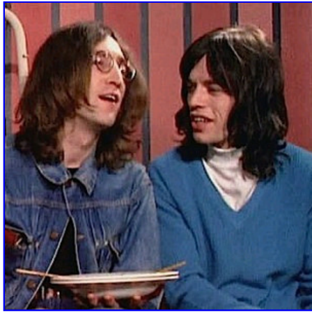
John Lennon and Mick Jagger back in the day

Now that Generation Boomer is shuffling slowly but surely towards the twilight of its purchasing power, spending far more time on the sofa than in the clubs or under the headphones, the DVD is becoming the preferred delivery system for the sounds – and, you bet, sights – of yesteryear. Of course with the Top Forty having long since gone TiVo, an audio-only package today seems as antiquated as, well, a record album ... remember those ? Even supposed sure-bets like those recent Beatles remasters, not to mention the Rolling Stones' deluxe Exile On Main Street repackaging, each make damn sure shiny happy li'l documentary films accompany all the aurally enhanced yeah-yeah-yeah's and tumblin' digital dice.