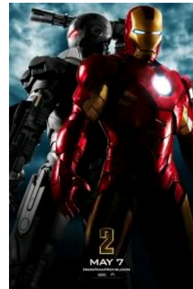
02. Iron Man 2 -- [4/5]