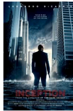
01. Inception -- [4.5/5]