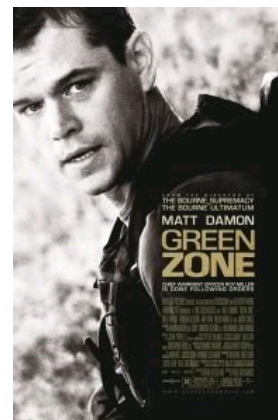
04. Green Zone -- [3.5/5]