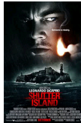
03. Shutter Island -- [4/5]