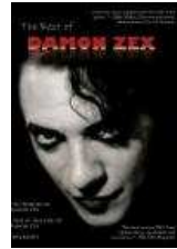
The Best of Damon Zex