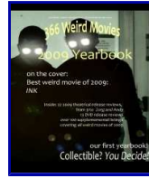
366 Weird Movies 2009 Yearbook