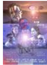
W the Movie