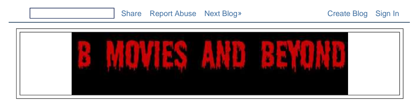
FRIDAY, SEPTEMBER 3, 2010