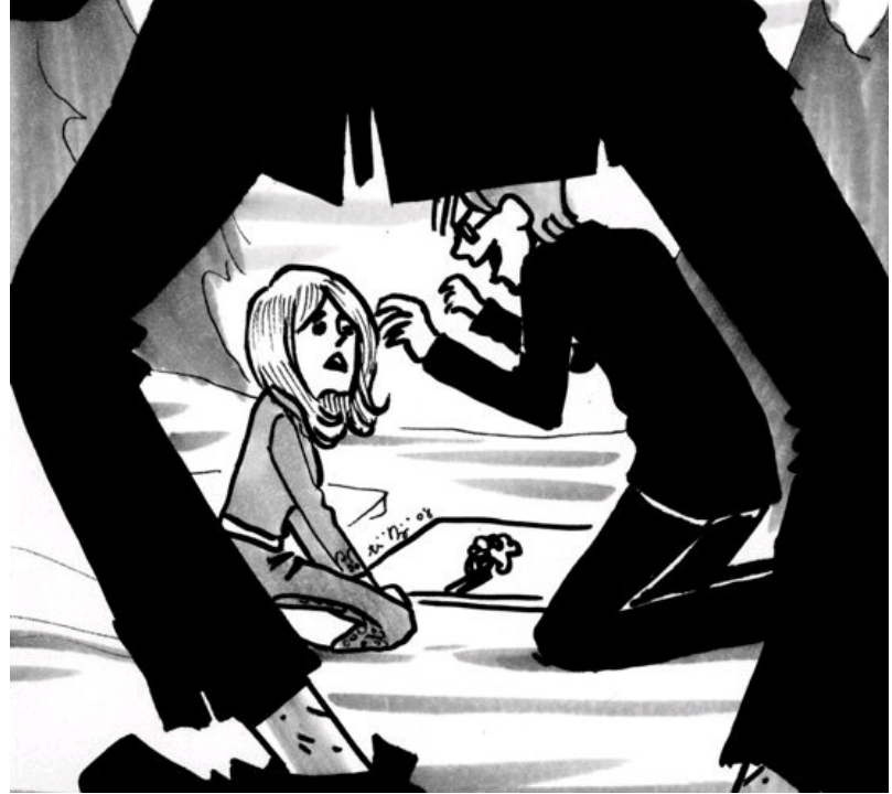
One of the earlier scenes in the film.

Scenes aren't animated in one style. Take the beginning of the film. Anyone who has seen Night of the Living Dead knows what happens. Barbara and Johnny are heading to the cemetary where they are attacked by an undead ghoul. During this scene, numerous styles of art are used. There are some still shots, there's a stop motion part, there's a part where puppets are used, each moment bringing it's personal visual style to the project. It can be jarring at first. I wasn't expecting it and I was a little shocked but some of the art was so incredible that I couldn't stop. Of course I had to stop because it was the middle of the day and one of my kids wanted to watch TV. Always being the loving father, I let them take over. I'll have you know that I pouted over it for a little bit though! HAHA!