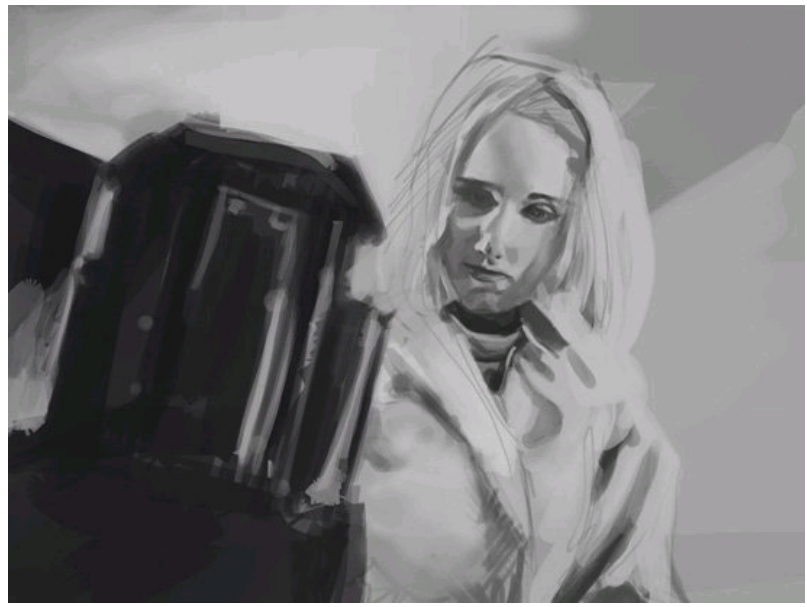
Just one small example of some of the art involved.

There is an incredible amount of artwork in here and it can be both hilarious and absolutely stunning. I haven't sat down to the entire film myself yet but I'll be putting up a review for it soon. I did watch the first little bit and this is the kind of thing that is going to have audiences divided right from the start. This is not so much a film as it is an art show on screen. I've found it very hard to explain to people just exactly how it works. It's not a straight up animated version of Night of the Living Dead. What they've done is taken the audio from NOTLD and put art over top of it as the visual.