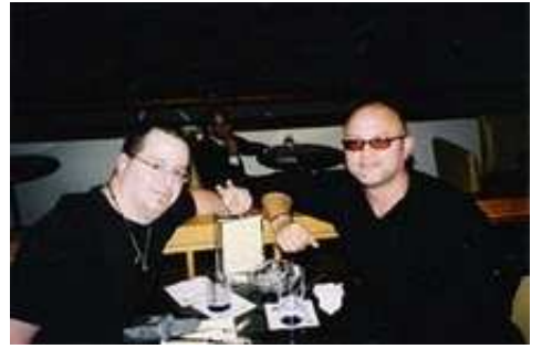
Revolution Man, Geoff Tate of Queensryche