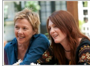
Let's Get Together Before We Get Much Older