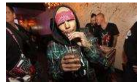
Hollywood Holt at Shag Lounge