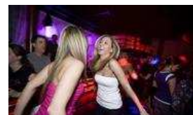
I Used to Love Her at Gallery 22