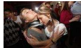
Wunderland at City Hall (NSFW)