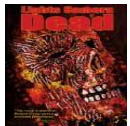
Lights Camera Dead SRS CINEMA