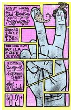
Bad Behaviour #2 with Fuzzy Logic & Friends @ Bella 6/16/2011