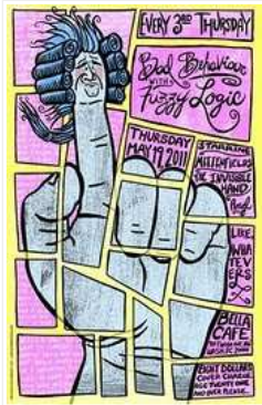
The First Bad Behaviour 5/19/2011