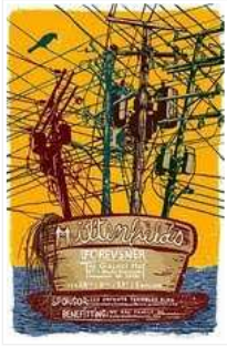
We Done Got Down. 2/28/2011