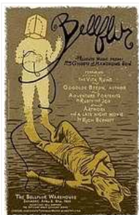
We Done Got Down Again. 4/2/2011