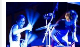
Houston Press Music Awards Showcase: The Bands