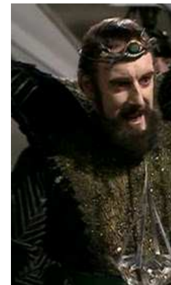
Graham Crowden (1922 - 2010)