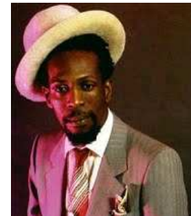
Gregory Isaacs (1951 - 2010)