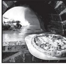
A typical pizza oven.

The first thing you have to do is lay out the diameter of the inside of the oven onto the kiln brick. Then apply wet sand onto the bed of two by two feet kiln newspaper to the outside of the sand form. Mix a bag of sand to a bag of fireclay. Add water to a consistency such that the mixture is soft and putty like, with your hands make a sort of brick form and apply it to the newspaper covered sand with a thickness of about two inches, starting at the base and working around and to the top. Prepare an opening for the chimney. Smooth the outside. Provide an opening of seventeen inches by a height of eight inches; this seemed like a good size for a fifteen inch pizza. This opening can be made rectangular or curved on top depending on your preference or bricks as was Alex's choice. In about two days when it has had a chance to dry and harden the sand can be removed, along with the newspaper on the inside surface. Again mix the one part fireclay with one part sand and this time add vermiculite to the mixture and apply about a two inch layer to the existing fireclay forming the bricks as stated earlier. Any newspaper remaining can be burned off when the oven is first fired up, remove all remaining sand by sweeping it out or use a vacuum cleaner to insure all the sand is removed. The final